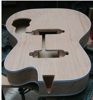
Raw KB161V Guitar before setting the dovetailed neck