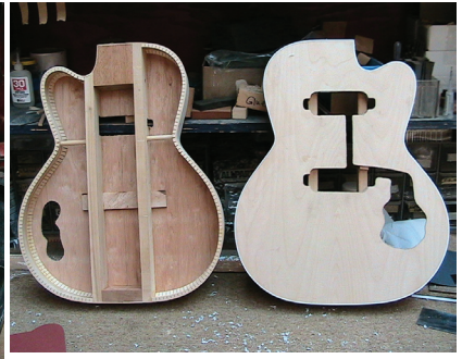
The "guts" of KB162V Bass (Left) The "Naked face" of KB161V Guitar (Right)

The vintage Kay Thin Twin has been dubbed the "Jimmy Reed" or "Howlin' Wolf" model because of the artists that played them in the early 1950's. The features that made this guitar the choice of Blues players was the sound of the hand wound pickups and separate center chamber that allowed an extra biting natural distortion without feedback. The combination was a mellow clean gritty sound with natural sustain.